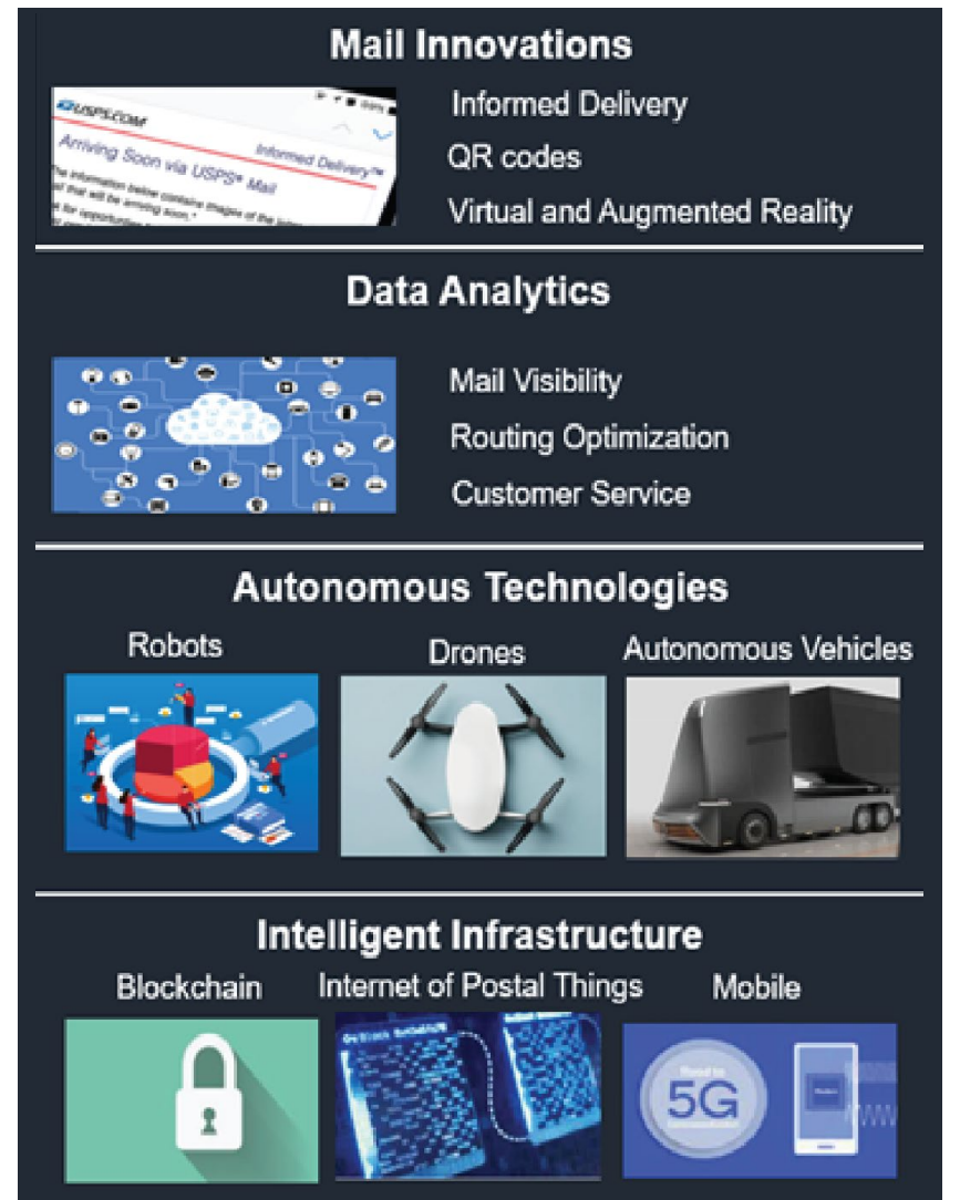
FIGURE 1: THE OIG’S PAST PAPERS FOCUSED ON FOUR MAJOR TECHNOLOGY AREAS